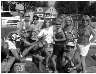
"Ladies of the 'Hood'" aka VS Boat Babes!