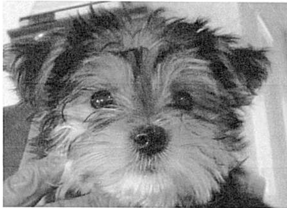
Meet our newest neighbor, Moose.

Many of us enjoy seeing our neighbor's dogs. In order to keep everyone safe and accommodate those who do not like to greet your pets, please make sure you comply with the Harrison Township ordinance that requires you to keep your pets on a leash while walking them and don't let your pet wander out into the street while out playing. In addition, please be considerate of your neighbors and 'pick up' after your pets! Thanks for your cooperation.