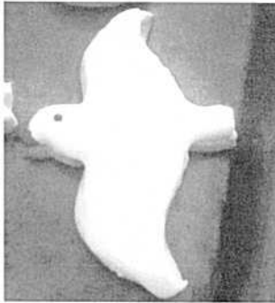
seagull cookie fresh from the oven