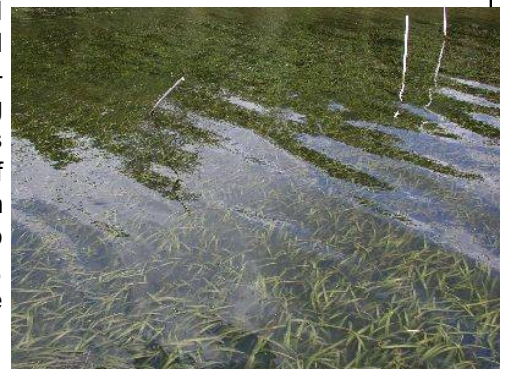
Native Eel Grass

Several concerns have been raised regarding the effectiveness of the canal weed treatment this year. According to The Pond Guy, we must be careful to NOT kill all of the native plants in our system, as it would allow the non-native plants to take over and become dominant. It is a delicate balancing act. He believes that perhaps our 2nd treatment was applied too late this year, which reduced its effectiveness. The Pond Guy recommends one of two options for the 2010 season: 1) Approve a '3-Treatment' option, which would allow him to react to what is growing most rapidly at the time and to treat 'as needed'; or 2) Apply the 2nd treatment earlier. With option 2, however, a regrowth may appear later in the season. Please attend the General Meeting to learn more as part of the dues/assessment discussion.